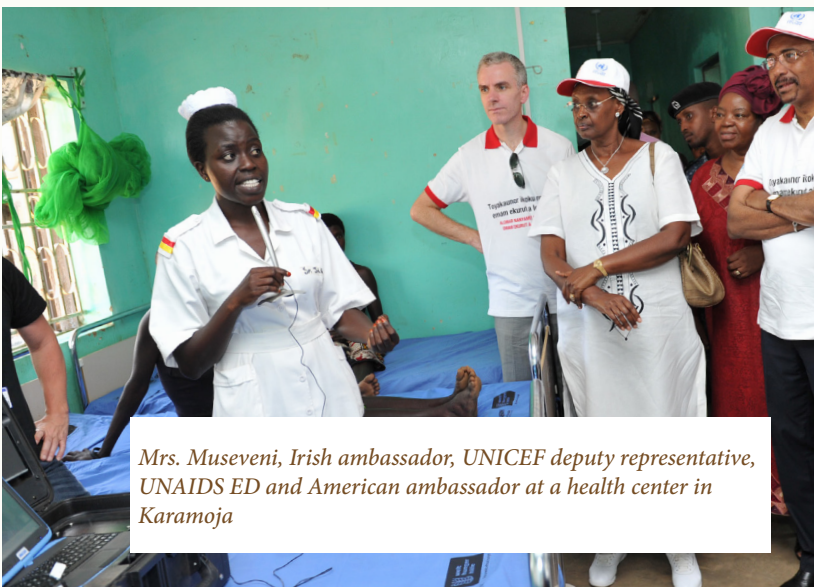
Mrs. Museveni, Irish ambassador, UNICEF deputy representative, UNAIDS ED and American ambassador at a health center in Karamoja