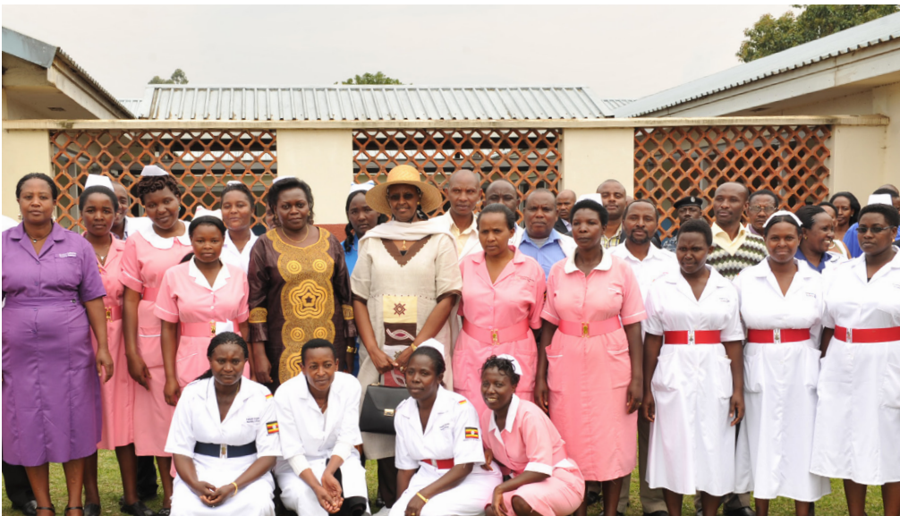
◀ Mrs. Museveni with health service providers in Kisoro