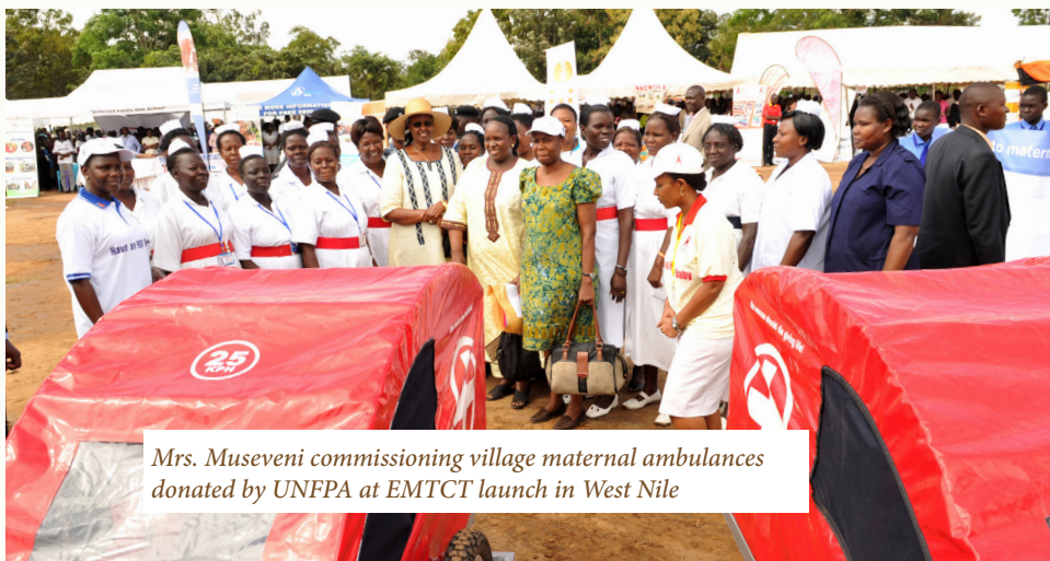
Mrs. Museveni commissioning village maternal ambulances donated by UNFPA at EMTCT launch in West Nile