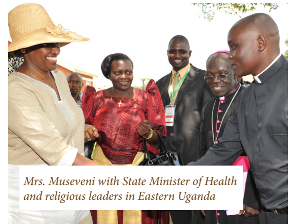
Mrs. Museveni with State Minister of Health and religious leaders in Eastern Uganda