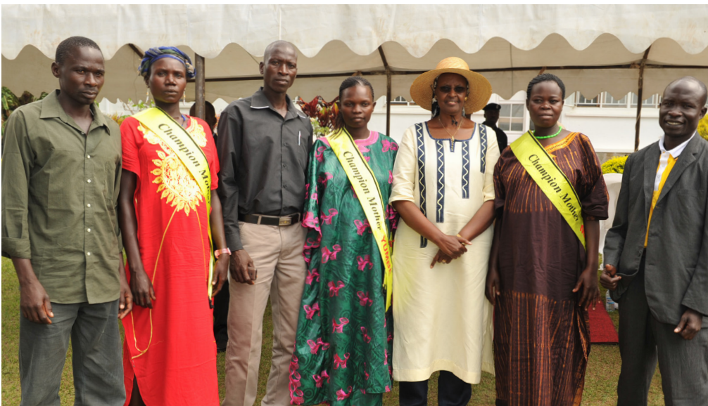
◀ Mrs. Museveni with winners of the pregnant women Community beauty contest