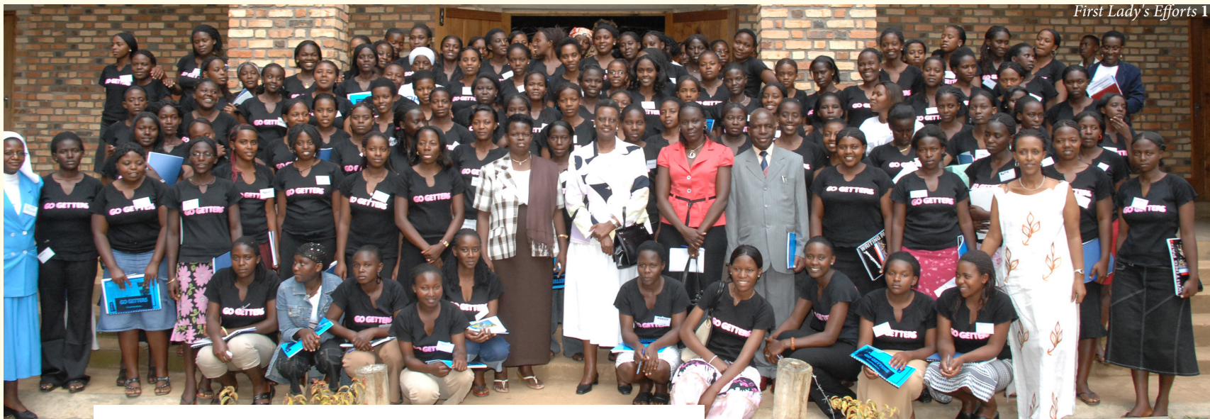
Mrs. Museveni interacting with young people during the cross-generational sex campaign