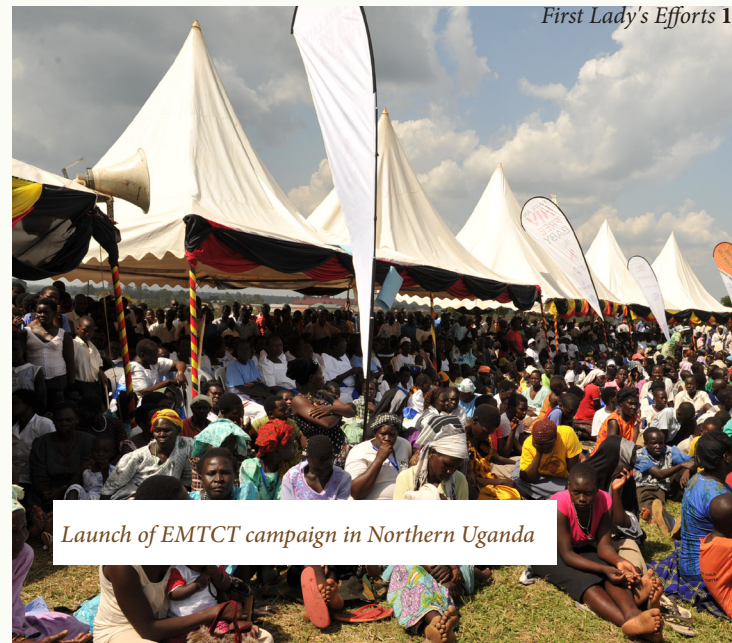
Launch of EMTCT campaign in Northern Uganda