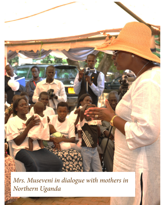
Mrs. Museveni in dialogue with mothers in Northern Uganda

She works with religious and cultural leaders from different localities in their capacities as gatekeepers for social norms and values to mobilize communities for social change.