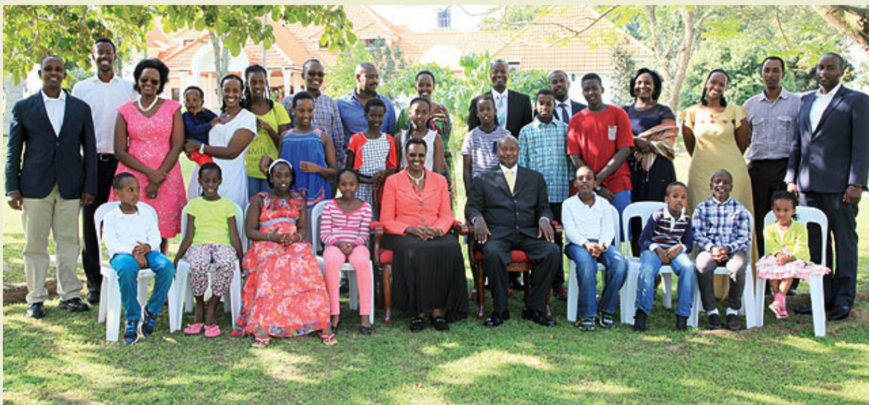
Mrs. Museveni with her husband The President, their children and grand children