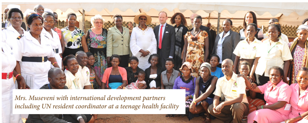
Mrs. Museveni with international development partners including UN resident coordinator at a teenage health facility

Other partners have included the American Government, Irish Aid, DFID.