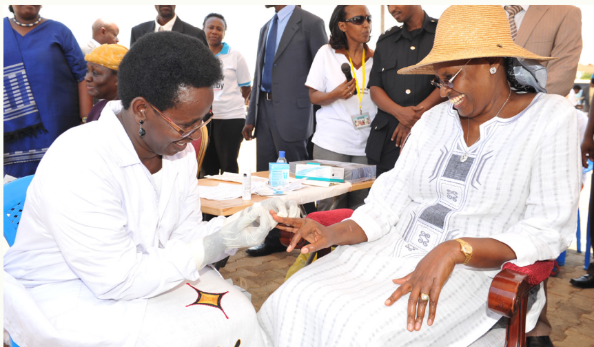
Mrs. Museveni, The President and key National leaders taking public HIV tests