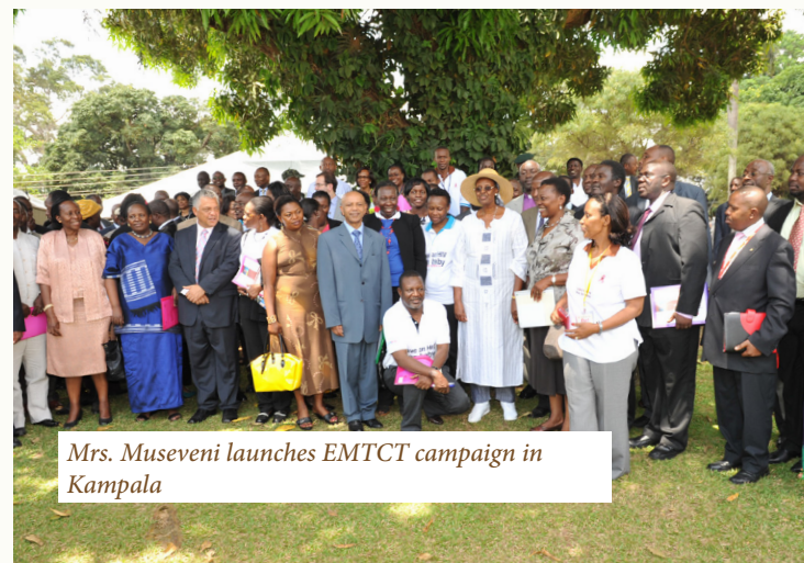
Mrs. Museveni launches EMTCT campaign in Kampala