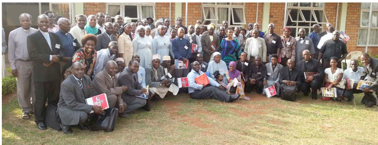
Religious leaders after the workshop

The Dialogue was highly participatory and concluded with a Statement of Commitment to participation in the HIV and AIDS and EMTCT Response, made by all the Religious Leaders both from the Muslim and Christian faiths.