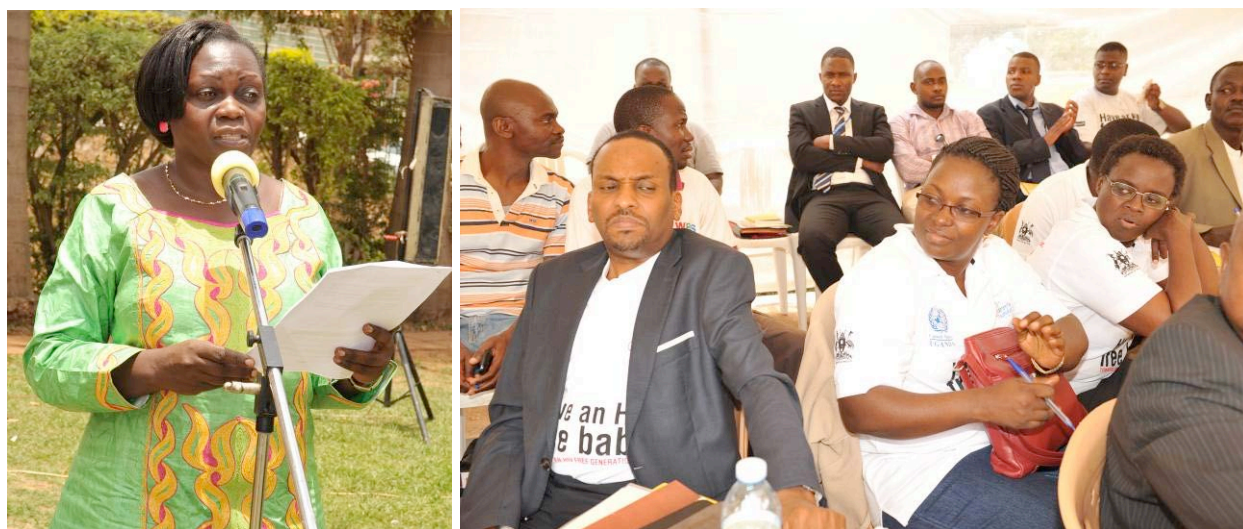
Hon. Minister Sarah Opendi- MOH presenting the issues raised during the consultative meeting

Some of the major issues hindering couple testing were said to be: the “blame game” amongst couples over “who infected who”, the fear of knowing ones results and the ensuing stigma from family and community members, poverty and inferiority complex that results in women being unable to make decisions regarding their reproductive health, lack of trust and the high level of infidelity amongst couples, as well as the male ego and attitudes resulting from gender stereo- typing.