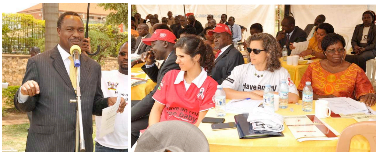
Hon Min of Health Dr.Elioda Tumwesigye addressing the stakeholders at the consultative meeting.