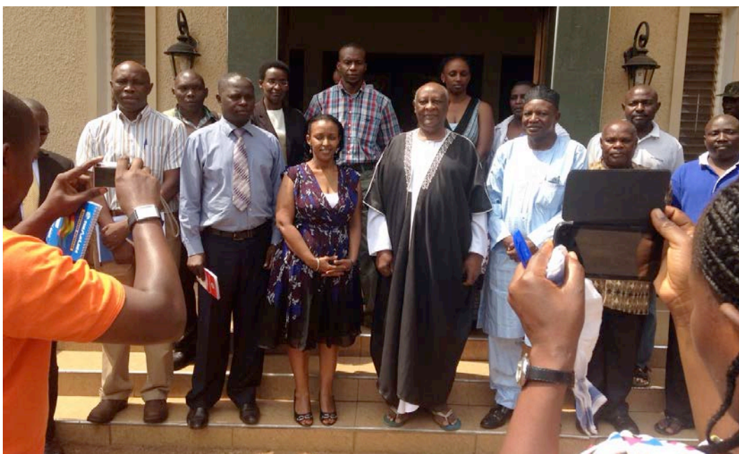
The king of Bunyoro posing a picture with the team after a dialogue with him.

They also solicited his support in mobilising his subjects to access services and participate in the Campaign activities.