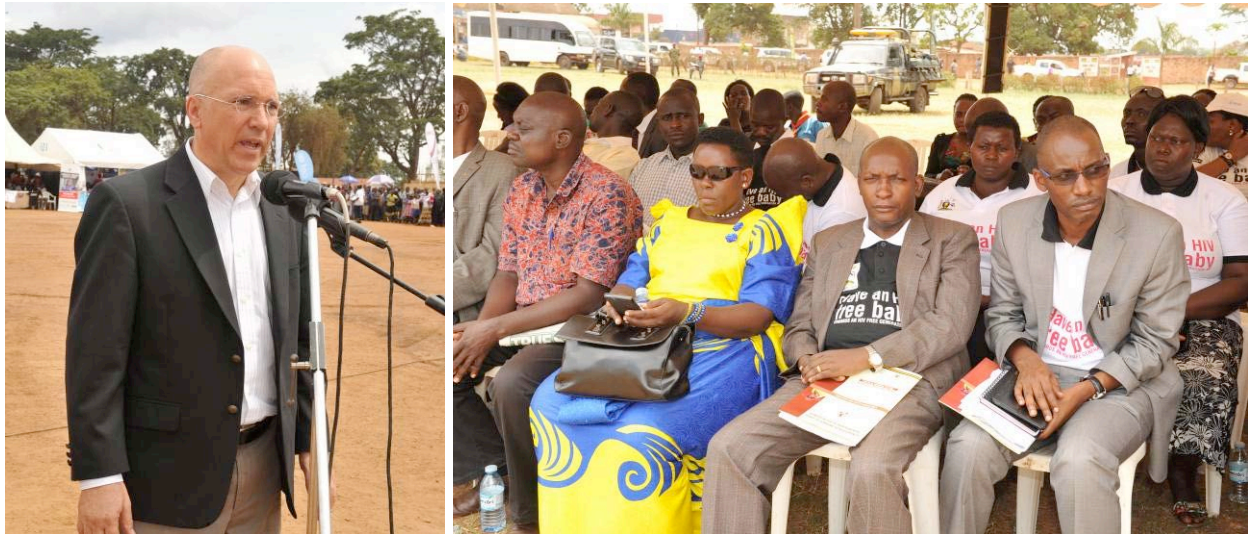
US Ambassador Representative and CDC Country Director addressing the masses at Booma grounds in Hoima

While Uganda has an amazing story about the battle against HIV and AIDS, these efforts are still not enough and that is why the Campaign still goes on. Consequently the US continues to pledge support to these efforts and urges the women and men of Uganda who have not yet taken that bold step to test to do so, since the percentage of, particularly men who do not know their status is still very high.