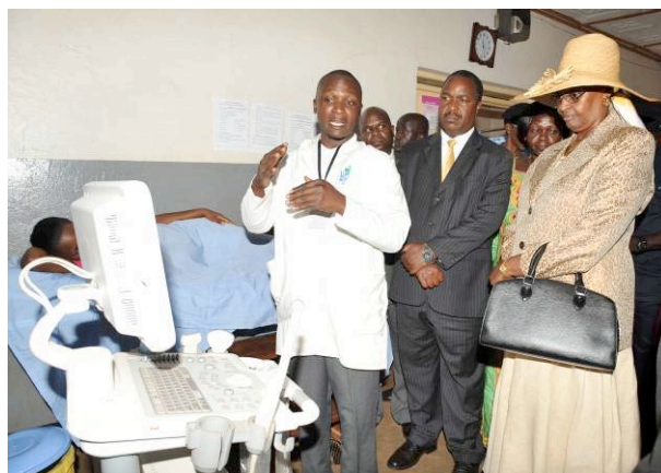
The EMTCT Champion at Azur Health Centre

Azur Christian Health Center IV was founded by the Bunyoro Kitara Diocese under the Uganda Protestant Medical Bureauhy (UPMB) with initial funding from Christians from a community in Azur in the United States of America.