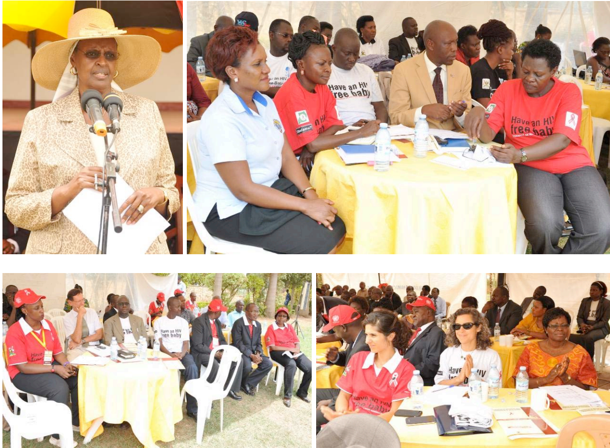
The EMTCT Champion addressing the stakeholders at the consultative meeting

“The period in which Uganda was applauded for our efforts in fighting the Campaign was at a time when people decided to exercise self discipline, a time when Abstinence and Faithfulness were the key message and not condom use”. “Today parents have opened the door for HIV and AIDS to come into the home by modeling the fact that it is okay to have extra marital relationships and this is a shame” she said.