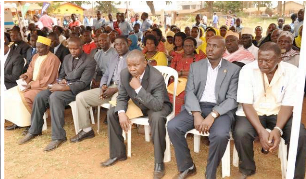
The EMTCT Champion making her remarks to the masses at Booma Grounds Hoima